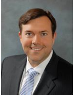
Clay Ingram House District 1

*Homes built, sold, renovated or retrofitted.