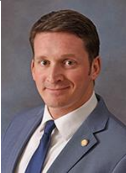
Dane Eagle House District 77

*Homes built, sold, renovated or retrofitted.