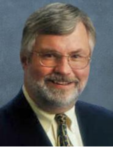
Jack Latvala Senate District 16

*Homes built, sold, renovated or retrofitted.